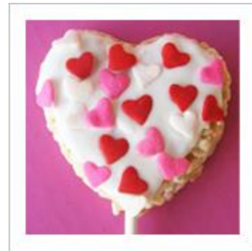
Heartwarming Sweet Treats On A Stick

You haven't started pinning on Pinterest yet and you want to get started? If so, click here .