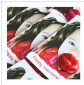
Candy Lips Create A Picture-Perfect Valentine