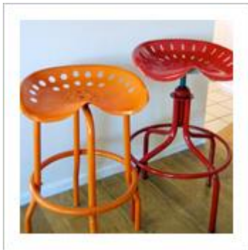
Turn Tractor Seats Into Hardworking Stools