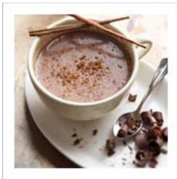
Quick Hot Chocolate For Cold Winter Days