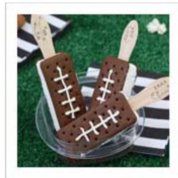
Guests Will Get A Kick Out Of These Footballs

You haven't started pinning on Pinterest yet and you want to get started? If so, click here .