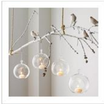
Branch Out In Your Winter Decor