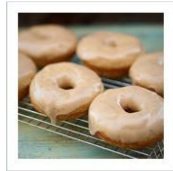
Out Of The Oven And Into Your Mouth

You haven't started pinning on Pinterest yet and you want to get started? If so, click here .