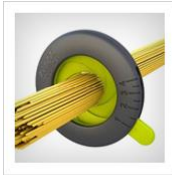
Measure The Perfect Amount Of Pasta