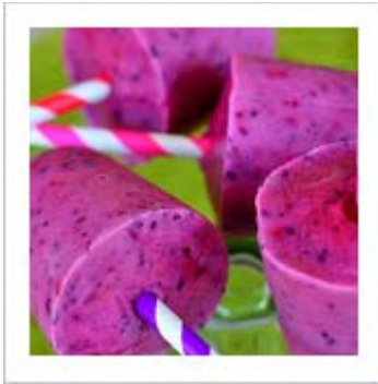
Berry Delicious Greek Yogurt Smoothie Pops