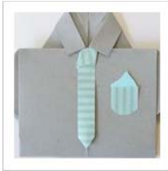
Make A "Shirt & Tie" Card Tailored For Dad