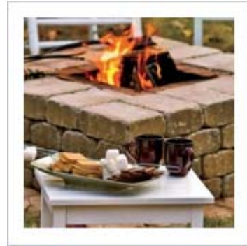
30 DIY Ideas For An Awesome Backyard

You haven't started pinning on Pinterest yet and you want to get started? If so, click here .