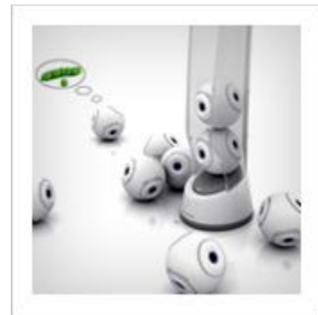
Little Speaker Spheres Are Like Peas In A Pod

You haven't started pinning on Pinterest yet and you want to get started? If so, click here .