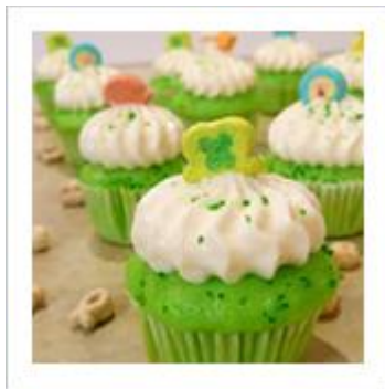
Lucky People Get These On St. Patrick's Day

Go Pinterest-ing! - Cool Stuff To Pin On Your Pinterest Boards