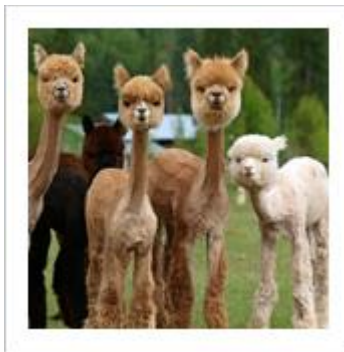
Sheared Alpacas Are So Cute! Sheer Genius!